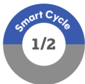
Pre-Transfer Embryology Services