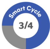
IVF Freeze-All Cycle